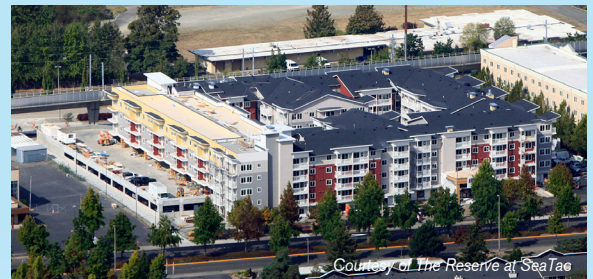
500 housing units since 2015 + 1,000 units planned

Follow the billions of public investment dollars – Invest with confidence in the SeaTac City Opportunity Zones