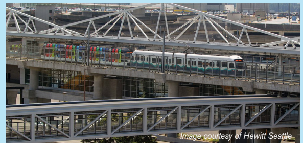
Three Light Rail stations serve the City