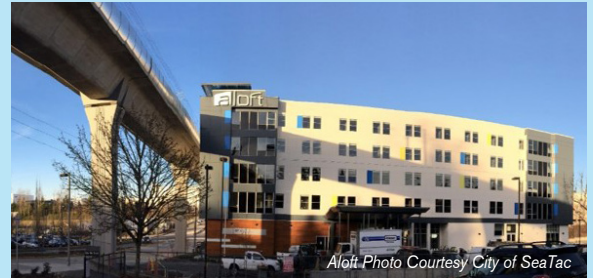
500 new hotel rooms since 2017 + 1,000 rooms planned