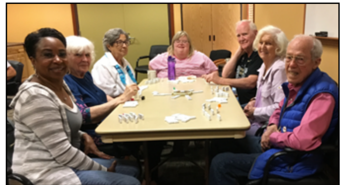
Drop in for some Mexican Train Dominos